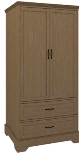
Model: DOWR22 34.5W 23.75D 71H

Stately Dorchester combines traditional detailing with modern architectural lines, while providing plenty of storage. Suit your style by choosing from a variety of hardware options and make an impeccable impression in any resident or patient room. Raised cabinetry promises ease of cleaning below case goods.